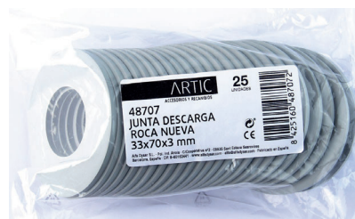
Presentación en bolsa