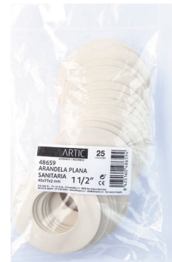
Presentación en bolsa